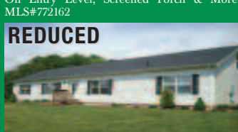
REDUCED $204,000 • 4400 Old Catawba Road

This Is An Adorable 2 Story Townhome And The Homeowners Assoc Fee Is Only $10 Per Month! Each BR Has A Private BA Too. Additional Half BA And Laundry On Entry Level. Cute, Modern Kitchen With Beautiful Cabinets And Pantry. New Wood Flooring In Living Room. Sliding Glass Doors Lead To Private Patio And Level Backyard. Walk To Shopping - Great Location. MLS#771265