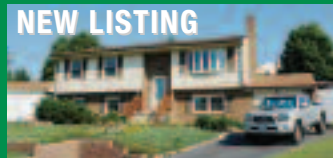
NEW LISTING $199,000 • 5238 Pin Oak Drive

Beautiful Home In Hunting Hills Situated On 1.07 Acres. With Over 3400 Sq.Ft., 4 BRs, 4 Full BAs, Huge Bonus Room, Library, Completely Finished Bsmt W/In-Law Suite Including Full Kitchen, BR, LR, BA & Sep. Entrance. Laundry On Entry Level, Screened Porch & More. MLS#772162