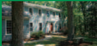
$374,950 5013 Upland Game Road

Spectacular Mountain Views!! All Brick Colonial With Over 3700 Sq. Ft. First Floor Master Suite With Spanish Tile Flooring. 4 Additional BRs Up With Jack And Jill BA. Dream Kitchen w/Granite, Tumbled Marble Backsplash & Large Island. Huge Great Room With Floor To Ceiling Windows For Views And Natural Light. Large Deck With Pergola, 3 Car Attached Garage. Please Visit My Website For Virtual Tour. MLS#768590