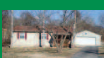
$126,950 • 2006 Carvin Street

Over 2100 sq. ft. on entry level. Full attic w staircase for tons of "floored" storage. Beautiful open kitchen with island, large breakfast area and formal dining room. Formal LR and family room with fireplace. Master suite w/walkin closet, master bath with jacuzzi tub and separate shower. Over 2 acres and the most beautiful mountain views! MUST SEE !! MLS#77060