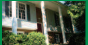
$179,950 • 5336 Wipledale

Beautiful and meticulously maintained North County home. 4 spacious bedrooms, 2 full baths, formal living room and family room, large open kitchen and breakfast area. Lovely & bright sunroom, beautiful landscaping and so much more. Mls#773404