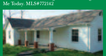
$114,000 • 719 Colonial Road

Completely Remodeled Home With All New Carpet, Paint, Bathrooms, Flooring, Roof & More. Look At This Garage With Double Doors In Front And Additional 3rd Bay On Side. Great For Workshop With Heat And Plumbed For Bath room. Central Air & Large Lot. MLS#766704