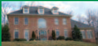
$599,000 • 1585 Strawberry Mountain Dr.

Spectacular Mountain Views!! All Brick Colonial With Over 3700 Sq. Ft. First Floor Master Suite With Spanish Tile Flooring. 4 Additional BRs Up With Jack And Jill BA. Dream Kitchen w/Granite, Tumbled Marble Backsplash & Large Island. Huge Great Room With Floor To Ceiling Windows For Views And Natural Light. Large Deck With Pergola, 3 Car Attached Garage. Please Visit My Website For Virtual Tour. MLS#768590