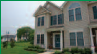
$139,000 • 117 Gretchen Court

Completely Remodeled And Ready For New Owners. Newly Installed Hardwood Floors, New Carpet, Updated Kitchen And BAs. 4 Spacious BRs, 2 Full BAs, Living Room, Dining Room, Family Room W/Fireplace. New Deck And 2 Car Attached Garage. Located In North Lakes Subdivision. Don't Miss Seeing This New Listing! Call Me Today. MLS#772142