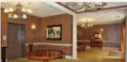
Elegant & Secure Entry Foyer