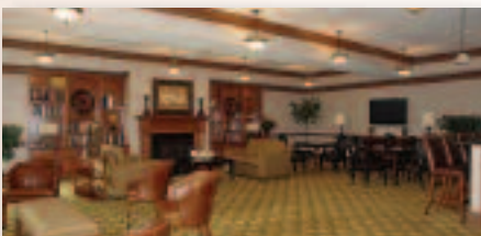
Private Club & Party Center