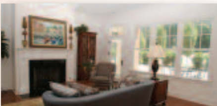
Exquisite Floor Plans