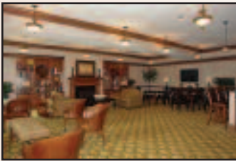
Private Club & Party Center