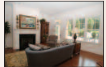
Exquisite Floor Plans